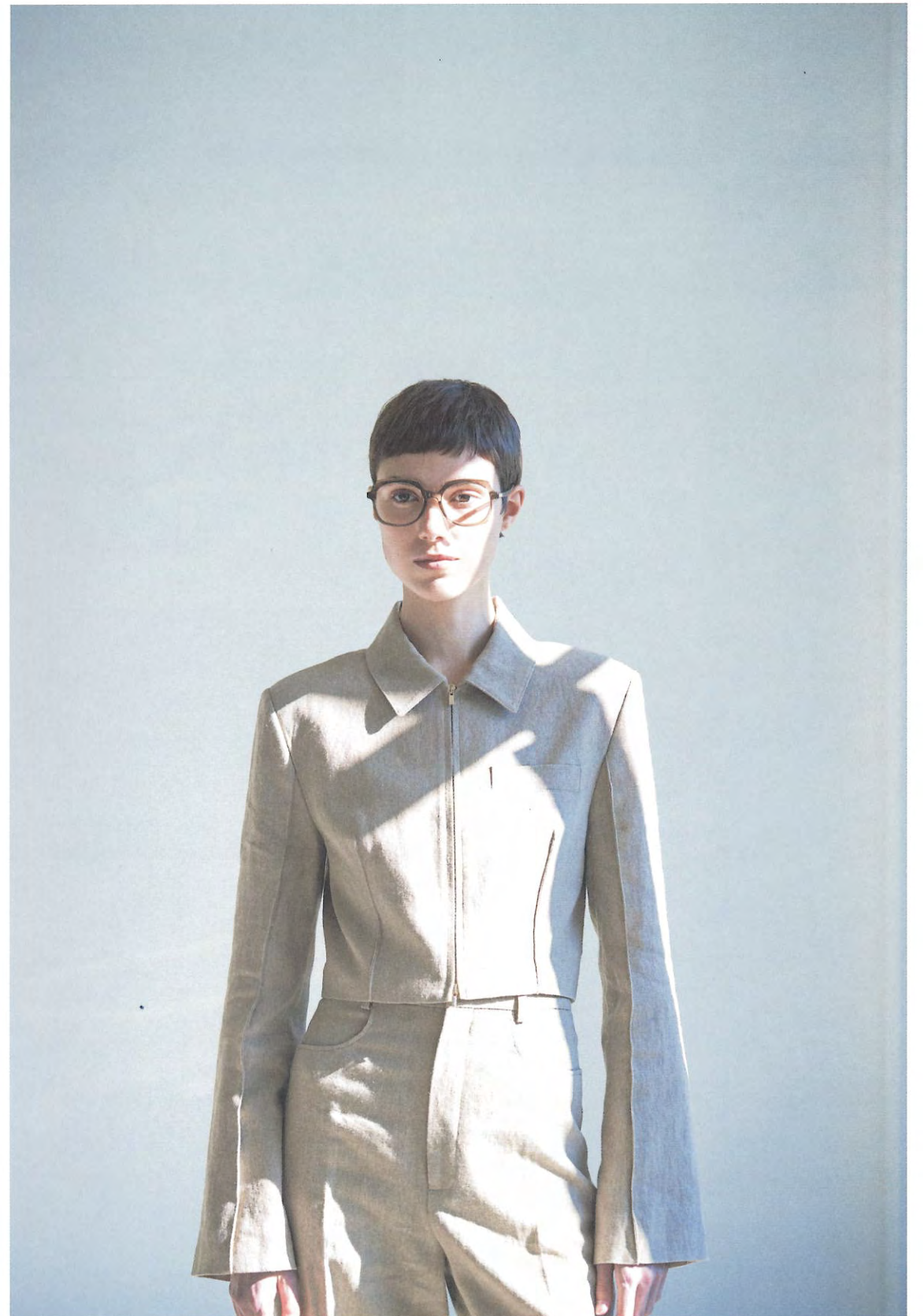
model: ISABEL color: 534 / size: 52 □ 18 / material: acetate