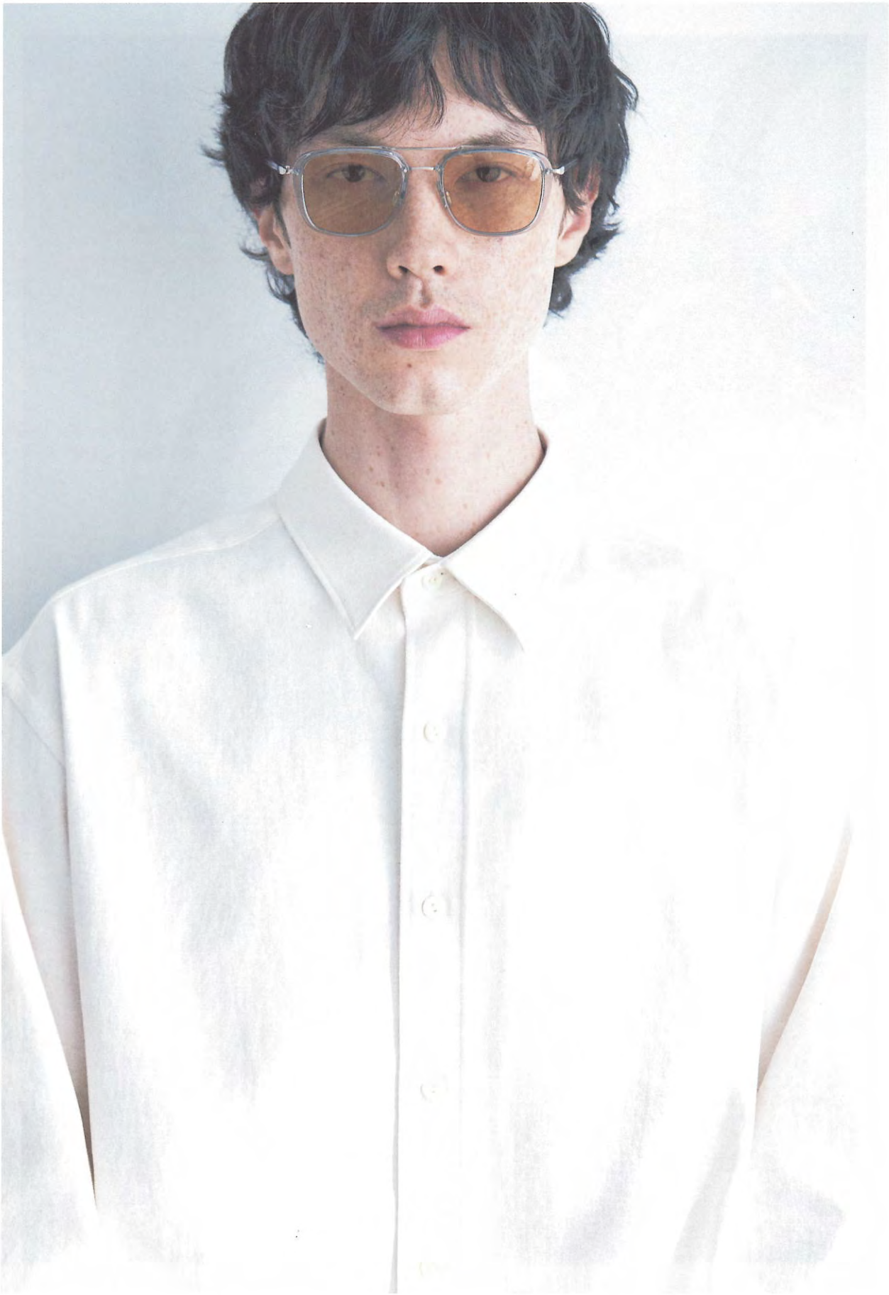
model: JACOB color: 490 / size: 50 □ 20 / material: titanium, acetate