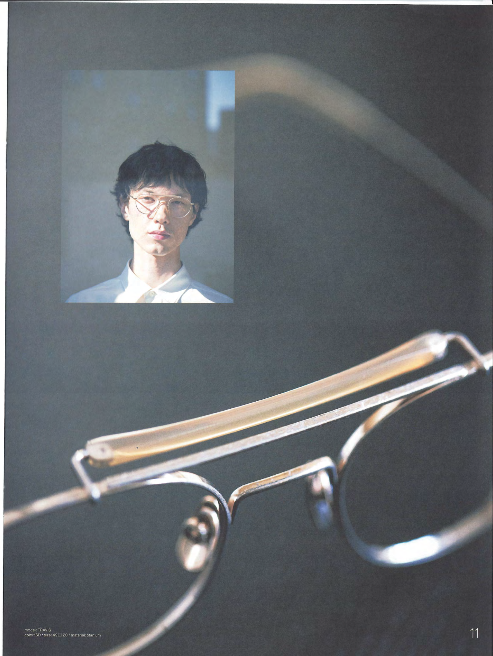
model: TRAVIS color: 6D / size: 49 □ 20 / material: titanium