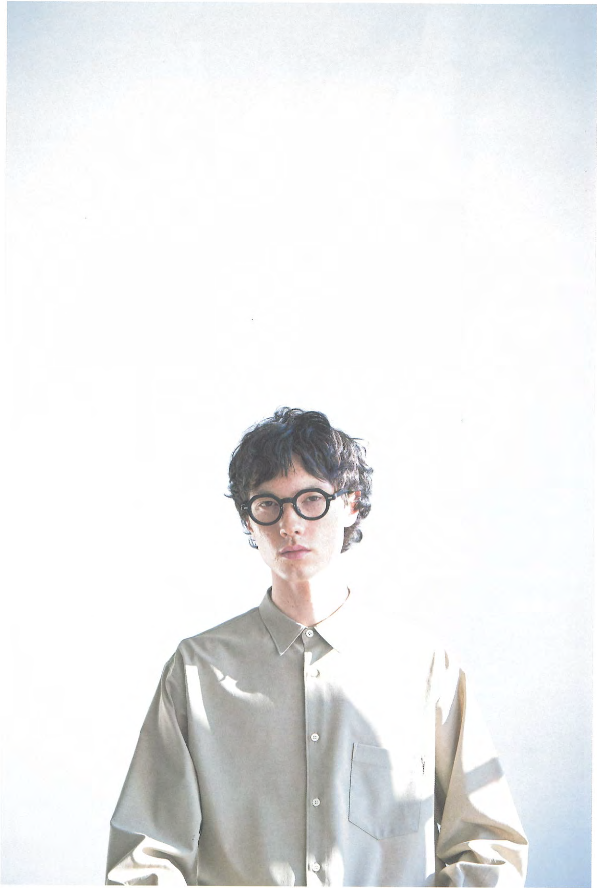
model: PHILIP color: 1W / size: 44.5 □ 25 / material: titanium, acetate