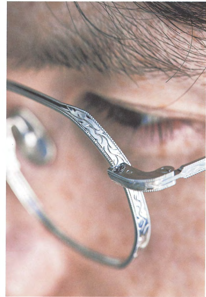
model: SID color: 1 / size: 45 □ 22 / material: titanium