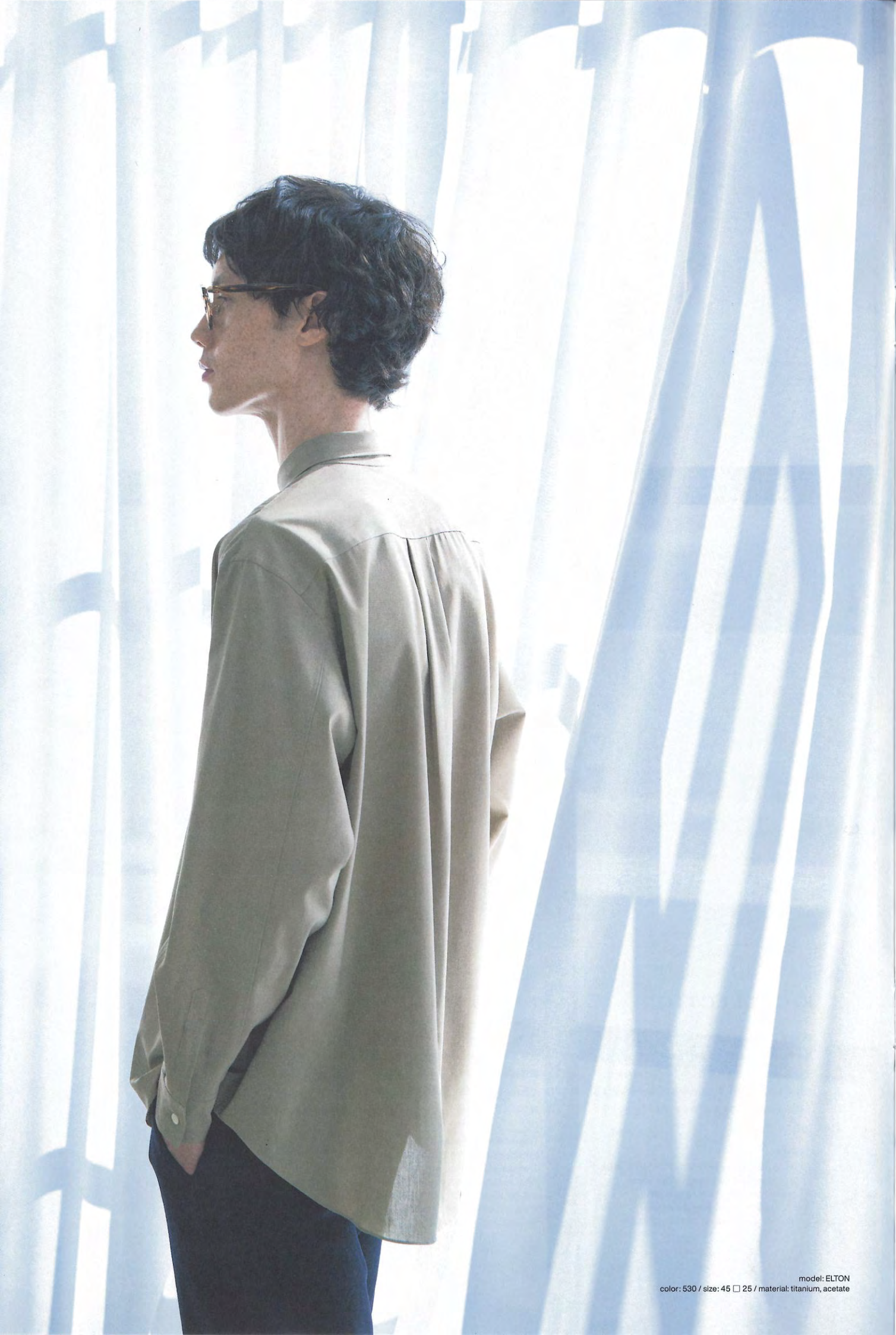
model: ELTON color: 530 / size: 45 □ 25 / material: titanium, acetate