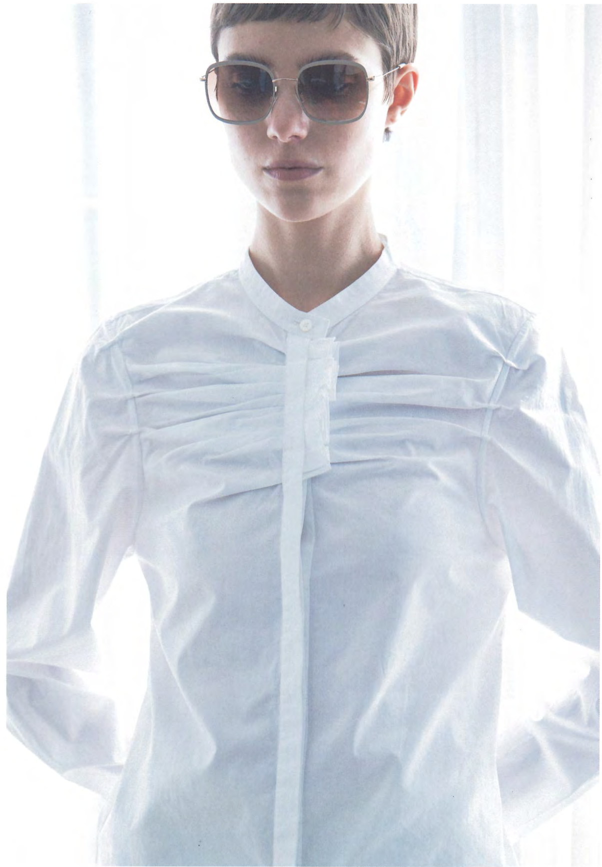
model: SUSAN color: 22G / size: 54 □ 18 / material: titanium