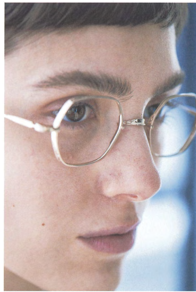
model: REX color: 6 / size: 43 □ 24 / material: titanium