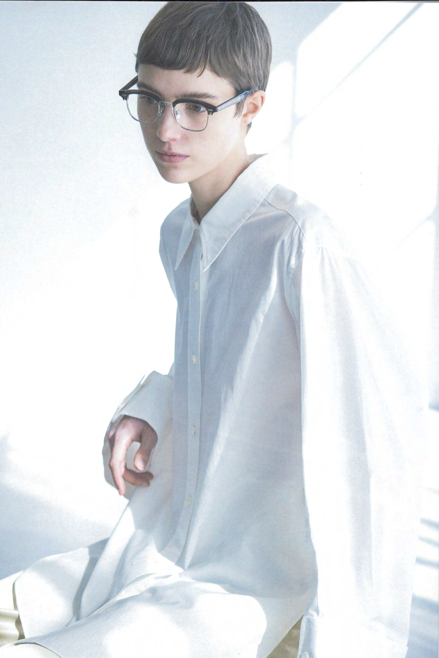
model: KENRICK color: 564 / size: 46 □ 21.5 / material: titanium, acetate