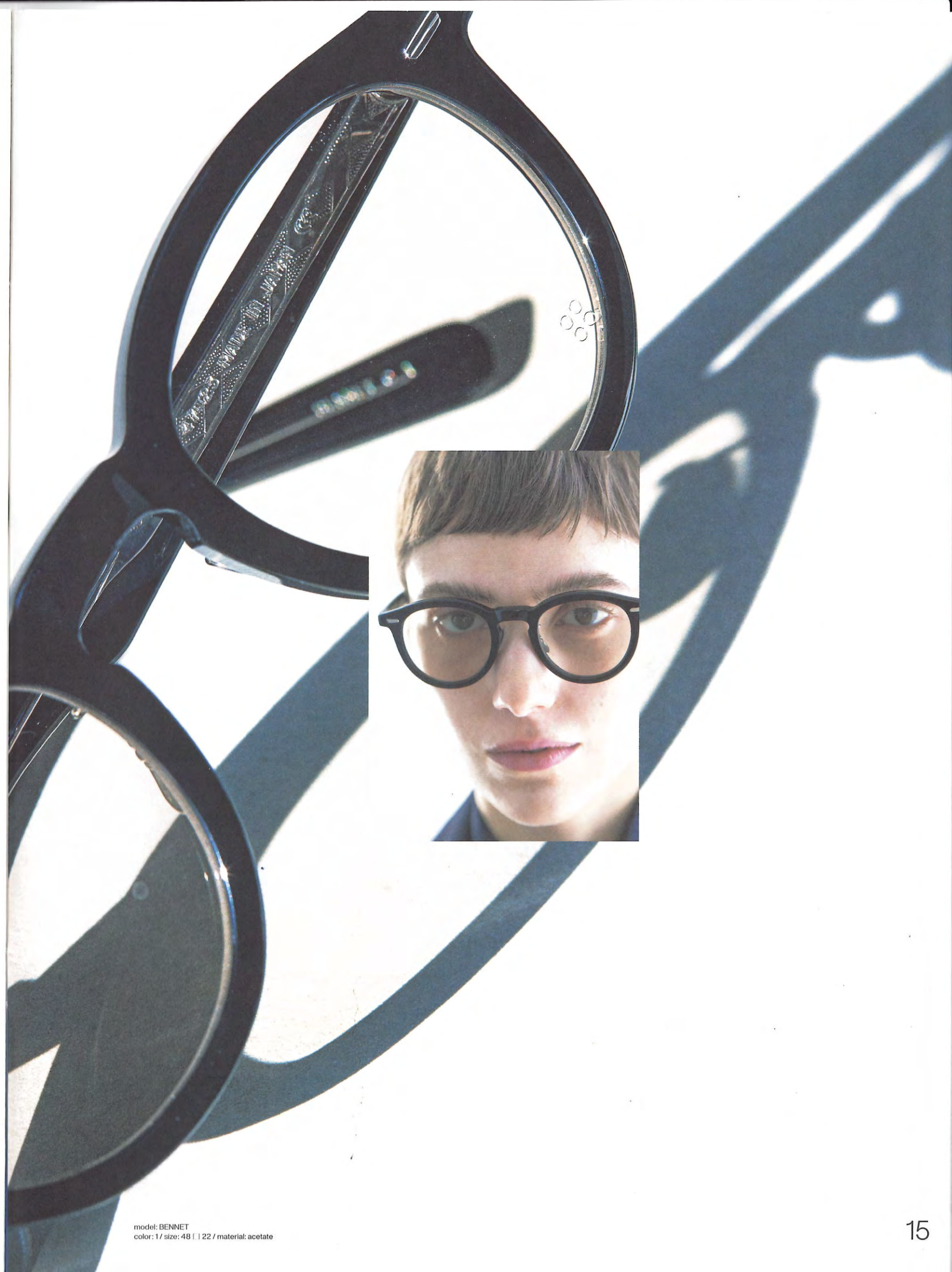
model: BENNET color: 1 / size: 48 | 22 / material: acetate